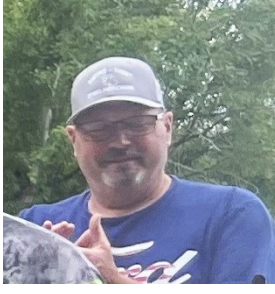
The Sunday Tournament was Cancelled because of the predicted high winds! 20 knots steady and 30 knot gust! No one was interested in going out in those conditions!